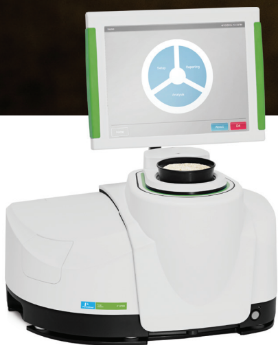
FT 9700 Full-Wavelength-Range FT-NIR Spectrometer